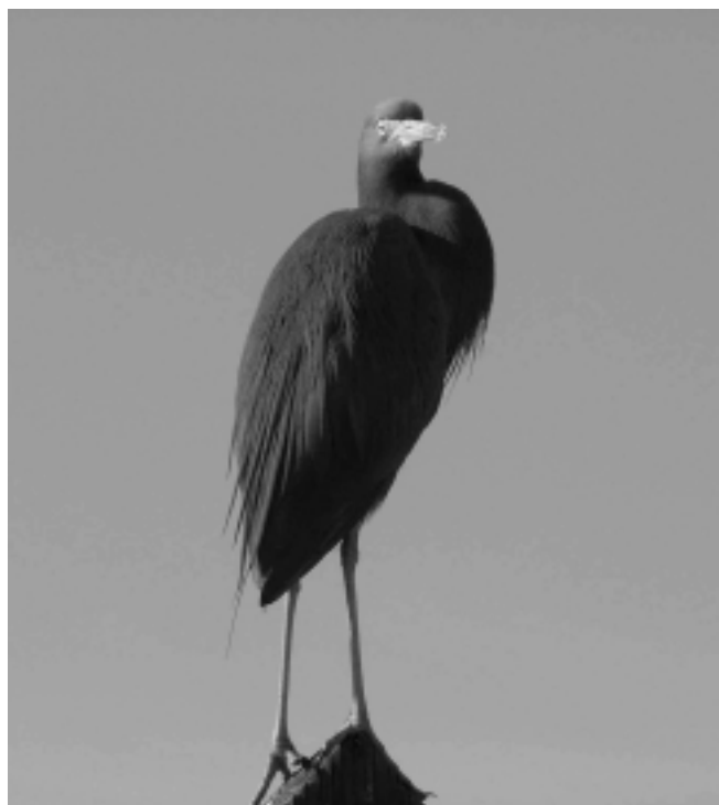
Little Blue Heron