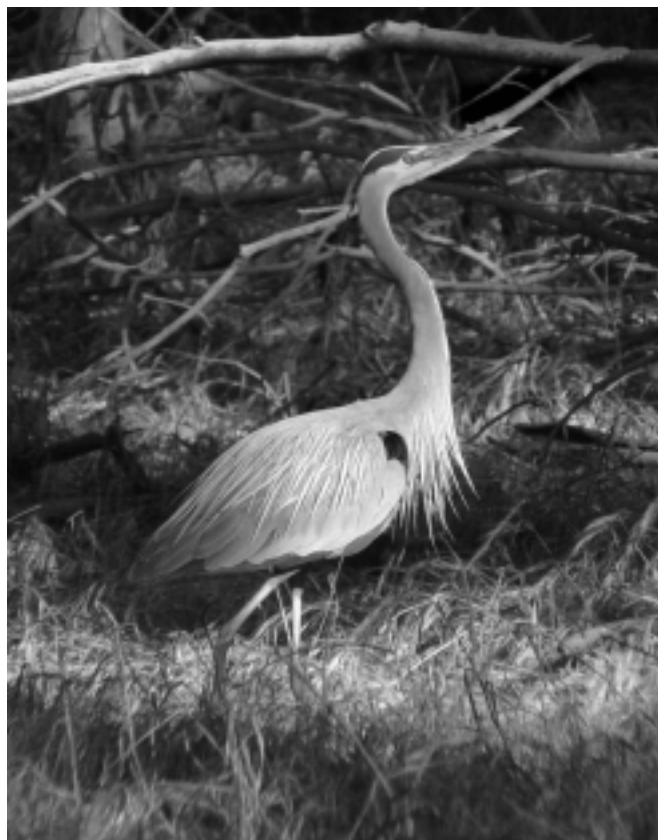
Great Blue Heron

Forest Service Chief Dale Bosworth USDA Forest Service 1400 Independence Ave. SW Washington, DC 20250 Phone: 202 – 205 1661