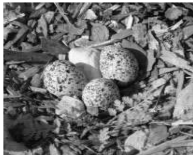
Killdeer's Nest

The Palos Verdes/South Bay Audubon is an all-volunteer organization. We have a surprisingly large array of leaders, even beyond those listed on the masthead, and we have room for more. We are looking for volunteers who will help with outreach on Third Tuesday Get-Togethers, advisors for Audubon YES!, new Board members, and writers for Hummin' . Let us know if you are interested by contacting me at 310-316-0041 or frances@monolake.org. I can already feel our South Bay Audubon community growing stronger!